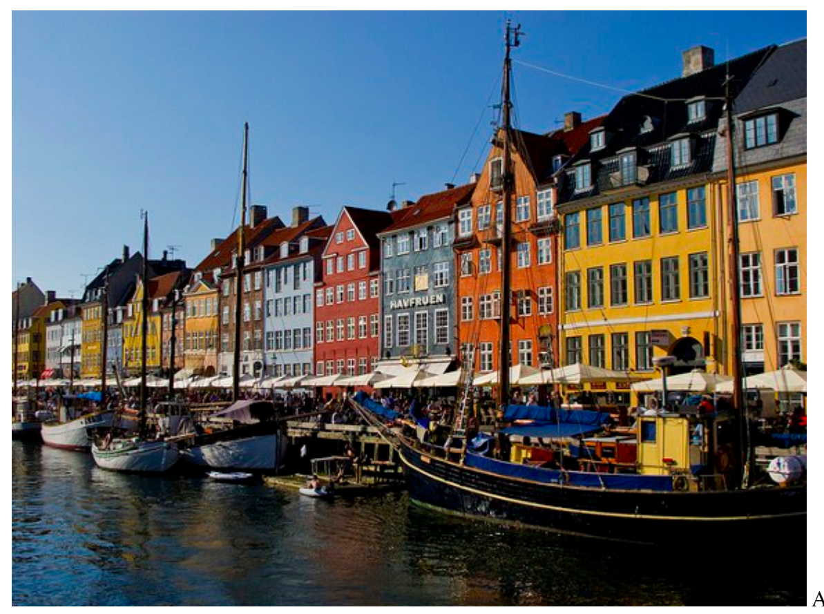
kaleidoscope of colors in Nyhavn.

One of the most iconic things to do in Copenhagen is to grab a six-pack of local Carlsberg or Tuborg, an ice cream, or hot dog and head down to Nyhavn (pronounced Nyw-hound) or "New Harbor." This 17th-century harbor is lined with postcard-perfect colored buildings, outdoor cafes and gorgeous tall ships. Locals and tourists alike lounge in the sun while listening to street performers, observing café-goers and enjoying good conversation. But be prepared – on sunny days a seat along the harbor wall can be a bit of a challenge to find!